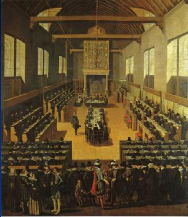
Synod of Dordt